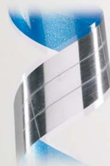
MaTriX Tape Technology

The patent pending MaTriX Technology embedded in the TX6A-SD™ 10Gig™ Copper Cabling System is constructed of discontinuous metallic elements that provide a very high degree of alien crosstalk suppression. This system for unshielded twisted pair cabling rivals the performance of a shielded system without the need for bonding and grounding and eliminates the concern for shield current flow arising from ground potential differences. The resulting channel performance eliminates the time and cost associated with cumbersome alien crosstalk field testing, providing an optimized alternative for deploying 10GBASE-T channel links up to 70 meters.