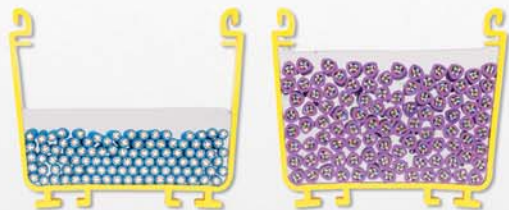
Panduit's Small Diameter Category 6A Cabling vs. Industry standard Category 6A Cabling

Panduit's small diameter Category 6A UTP Copper Cabling System with MaTriX Technology is a cost effective, cabling system that is fully compliant up to 70 meters. This high performance cabling system is comprised of unshielded twisted pair horizontal cable and patch cords which utilize 26 AWG copper conductors and patent pending MaTriX Technology to suppress alien crosstalk. Panduit® TX6A-SD™ Cabling requires 50% less routing space than standard Category 6A cables making it an ideal solution for cable intensive data centers.